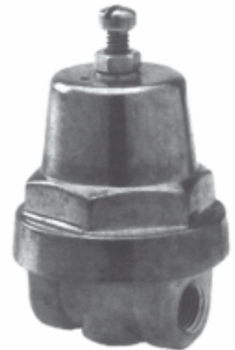
Type FRM-2 CRYOGENIC BACK PRESSURE OR ECONOMIZER VALVE

Type FRM-2 valves are available with three different body styles for pipe connections to enable it to be adapted to most any system: side inlet-side outlet, side inlet-bottom outlet, 2 opposite side